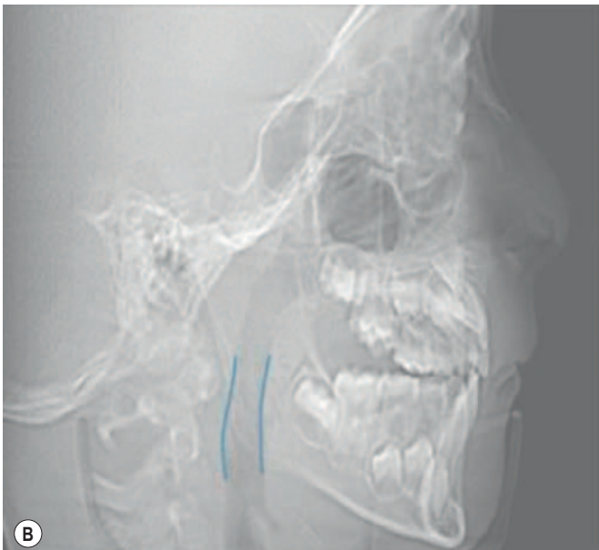
FIGURE 34-2 Note differences in cervical spine erectness and posterior airway area in pre-BBO Tx image (left) vs. post-BBO Tx image (right).