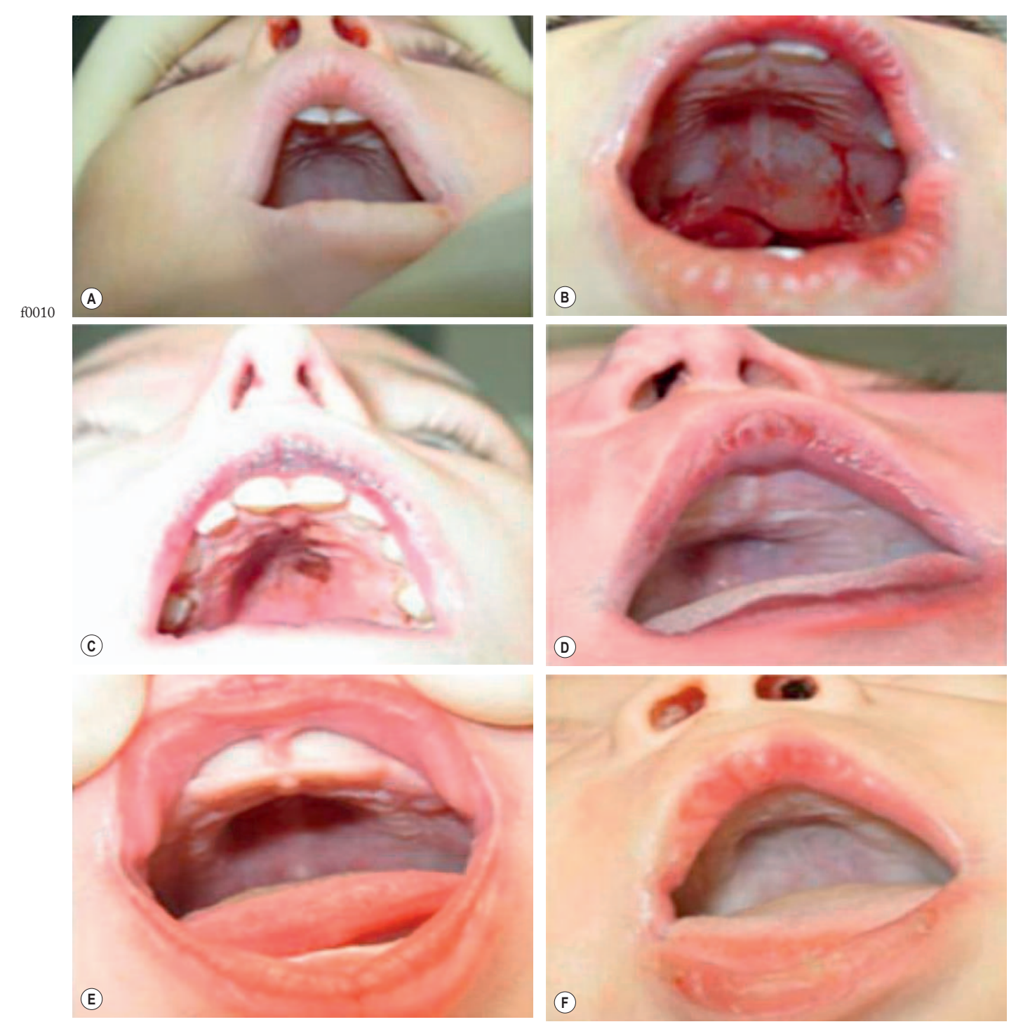
FIGURE 34-1 Montage of abnormal high and narrow hard palate in Cases 1–6. Note that all children present a visually recognizable abnormal high and narrow hard palate which is related to the development of the naso-maxillary complex during embryonic development considering age of children. On the first row on the left, on the second row in both cases, and on the third row from the top on the right, note the abnormal noses presented by the patients. The asymmetry of the nostril may not be obvious at first investigation; using photographs taken below the nose may help performing better analyses. Asymmetrical opening is often associated with asymmetrical septum and change in nasal resistance. When associated with high palatal vault, they indicate presence of a higher upper airway resistance and greater risk of abnormal breathing during sleep with addition of infectious or inflammatory reaction. From Rambaud C, Guilleminault C., Death, nasomaxillary complex, and sleep in young children. Eur J Pediatr. 2012 Sep;171(9):1349–58, with permission of Springer-Verlag 2012.

p0085 Until the recognition of BBO as a non-surgical option for improving posterior airway volume in actively growing children, 24 rapid maxillary expansion (RME) was considered the primary non-surgical orthodontic treatment of choice for treating OSA in children. 25